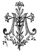
To Jesus through Mary

Our Lady has long been associated with the beauty of flowers and the coming of spring. This is fitting because she is both beautiful and the Mother of our Lord Jesus Christ, who is the life of the world. In May, the Church remembers our glorious lady with crownings and processions in her honor.